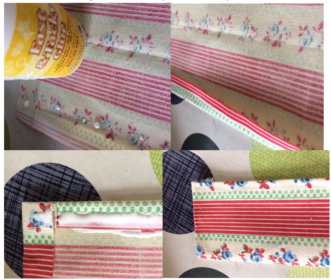
Or you can pin and sew hems if your fabric frays.

2- You can use fabric glue for hems if your fabric frays.